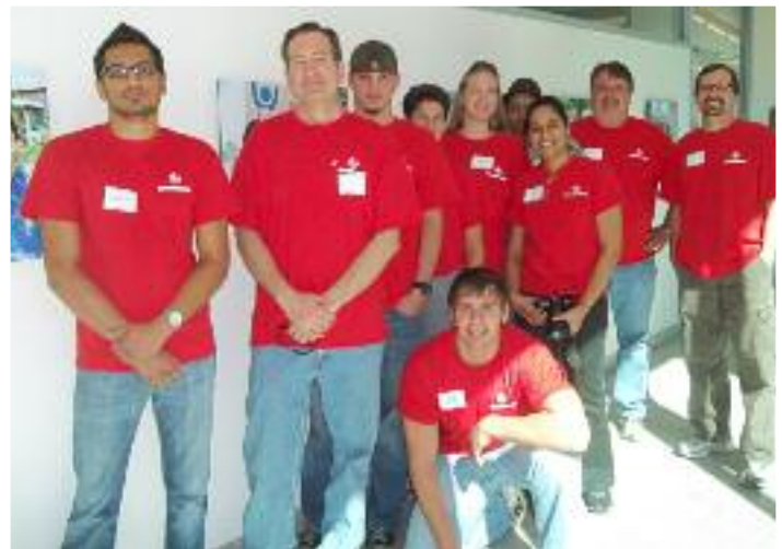
Thank you to Medtronic for giving employees a day off with pay to volunteer in the community. Recently employees attended Parent Leader training at Raising Special Kids.