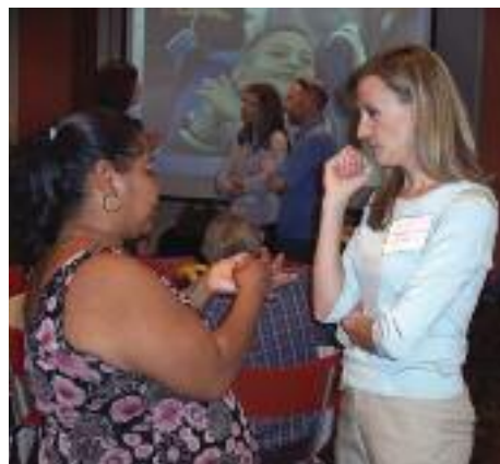
Attendees chat with therapists between presentations.

Two more conferences are being held in Yuma and Show Low this summer (see page 8).